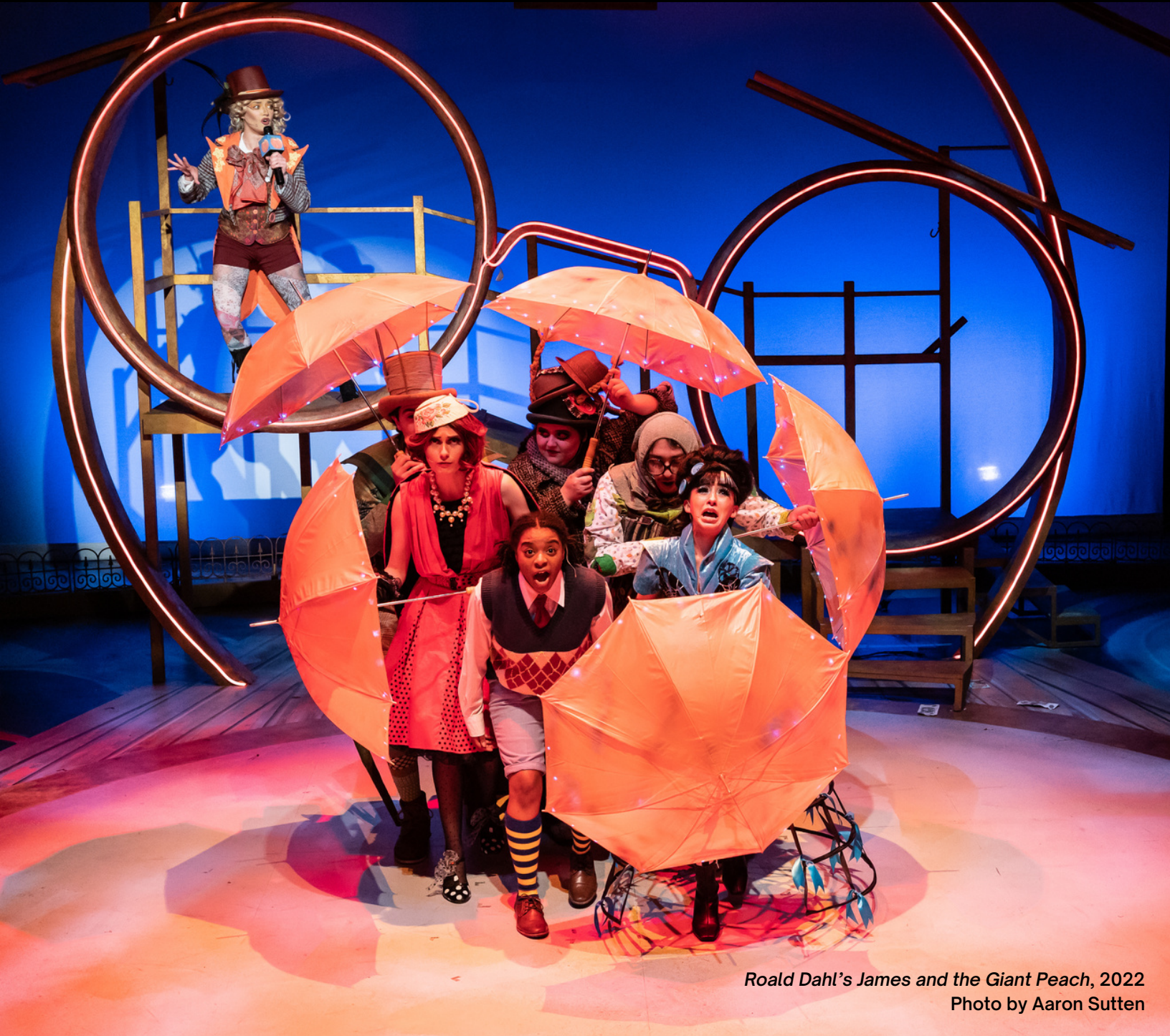
Roald Dahl's James and the Giant Peach, 2022